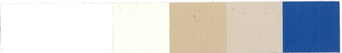
*001 White #101