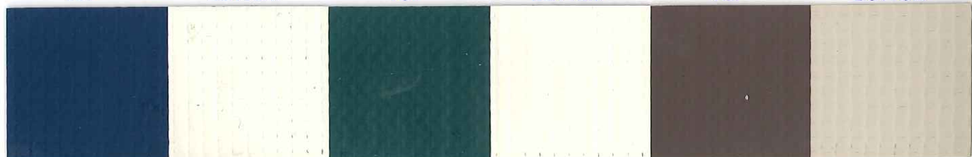
Navy/Eggshell #107-02 (x)