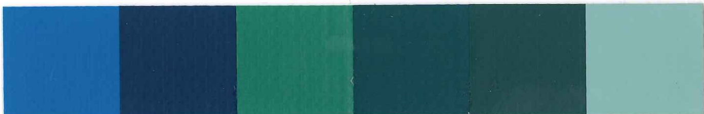
Bay Blue #106