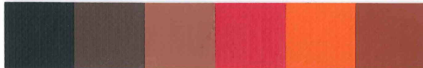
*020 Black #120